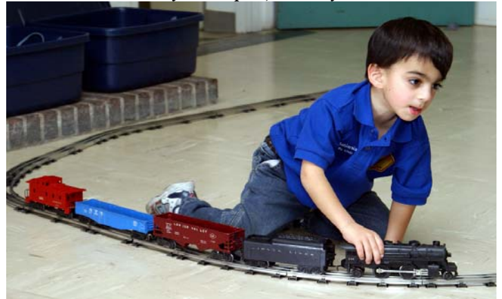
The January Display Theme: "Trains I Love".