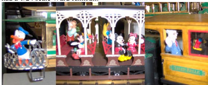
Disney Characters rode all sorts of trains at the July meet