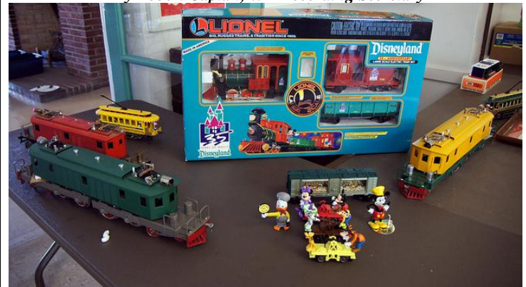
A Magnificent Display of Disney Toy Trains of all sizes