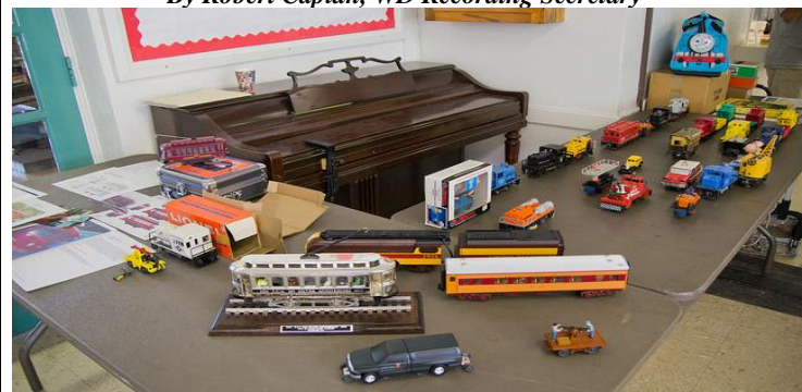
A Magnificent Display of Motorized Toy Trains of all sizes