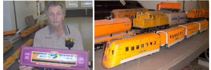
Dave's Airco Cars