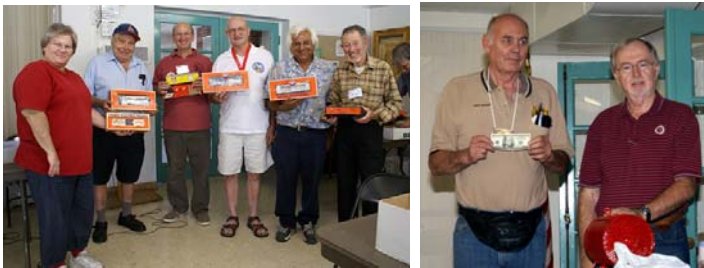
Door prize winners