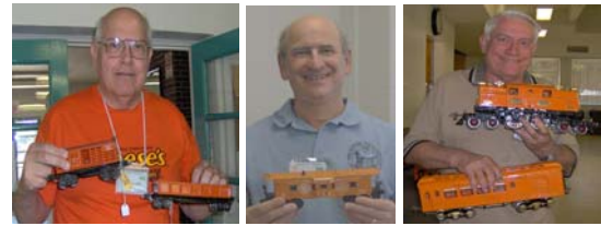
Harvey's 2652 etc. variations Harold's TCA Cabooses Larry's 3243 Ives