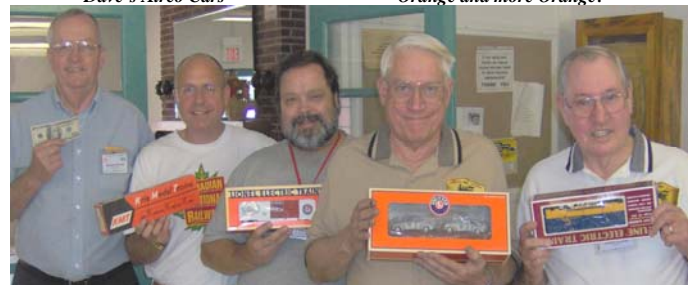
"Orange and more Orange!"