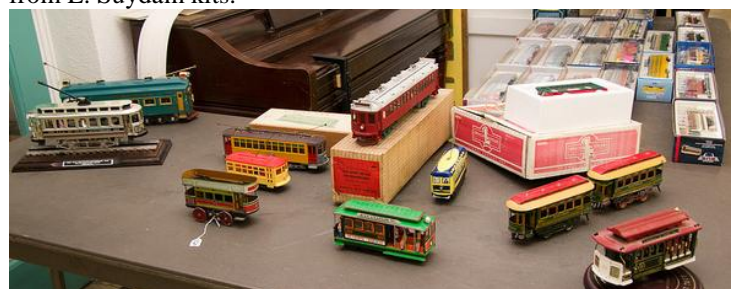
September Display Theme 'Trolley Cars'