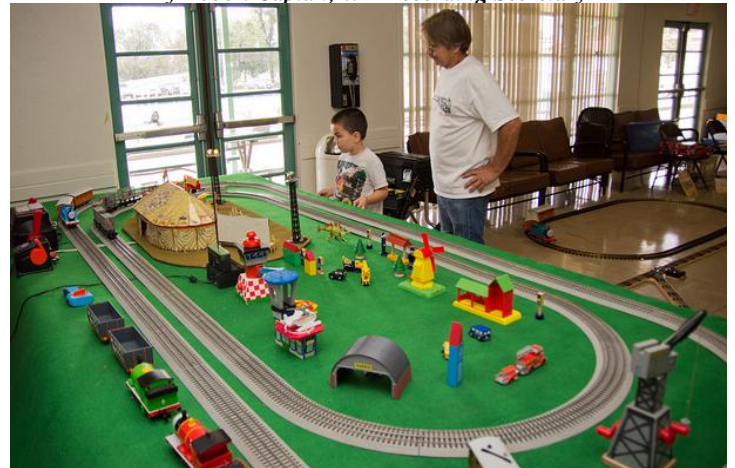
Special Layout Created for the September Kids Meet