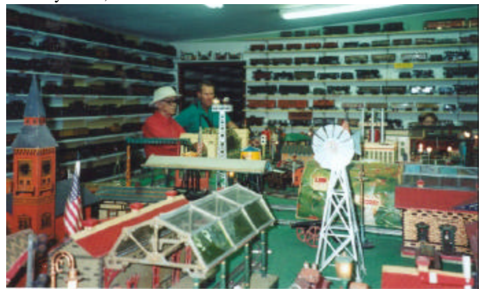
Ward Kimball was always inviting folks over to see his wonderful displays of toy trains that he had collected over the years

Ward's strong interest in Early Tinsplate Trains brought him into TCA Membership in 1954. Over the years he acquired a substantial collection of both domestic and foreign Toy Trains and became an expert on the many early manufacturers. He has been a great friend of Western Division TCA and an inspiration to many of us, and we will miss him.