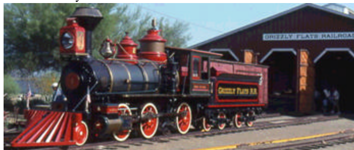
Named for an 1800's opera star, the "Emma Nevada", an 1881 Baldwin 'Mogul' 2-6-0, was the pride of Ward and Betty Kimball's backyard Grizzly Flats Railroad.

In 1938, Ward bought a full-sized 1881 steam locomotive, which he restored and installed with other cars and engines on a track in the backyard of his San Gabriel home. The "Grizzly Flats Railroad", so interested and fascinated Walt Disney, that he decided to build his own Carolwood Pacific Railroad in the yard of his Hombly Hills mansion.