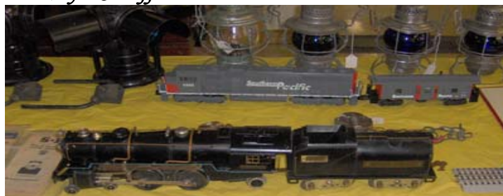
Some of the May Meet 'Southern Pacific' Theme Display Items