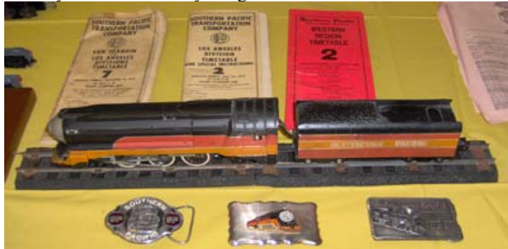
A sampling of the 'SP Display Theme' items