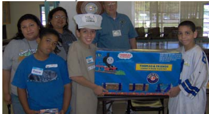
Sycamores kids took home a brand new Lionel 'Thomas the Tank' set

Thanks to all who attended and helped out to make the kids meet a success. See you in July.