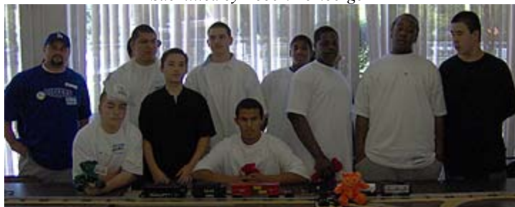
Kids from the Los Angeles Optimists Boys Home enjoy running trains.