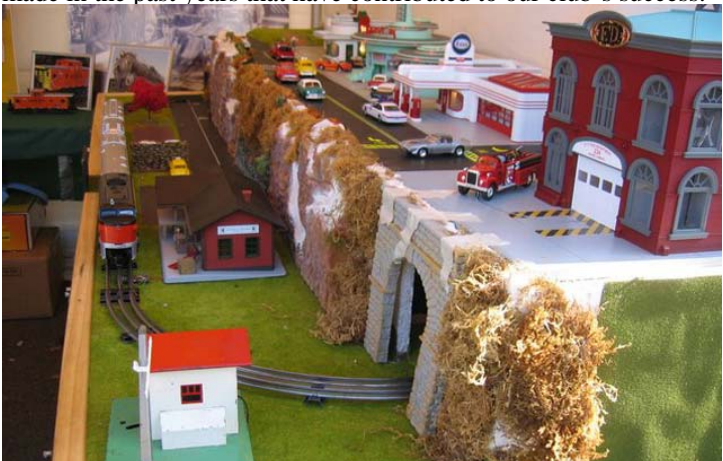
Western Division's Interactive Layout at the Fullerton RR Days Event