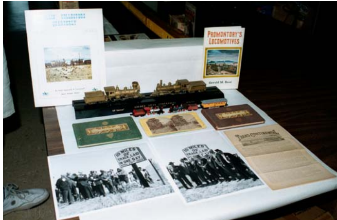
Ward Kimball's homage to the 'Golden Spike' Ceremony

The display theme for the May meet was to celebrate the joining of the east and west regions of our nation with the completion of the first transcontinental railroad on May 10th 1869.