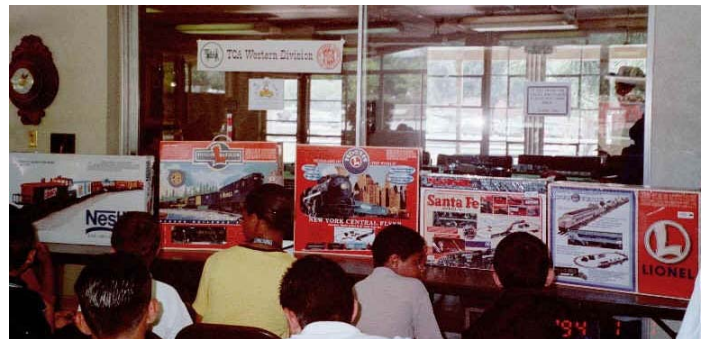
Some of the goodies awaiting new homes.

In addition, several offspring of TCA Western Division members were on hand to participate in the festivities and receive gifts. Some of the train sets given away were provided through direct donations from Lionel, K-Line and Bachman. Western Division purchased several sets. A cash contribution was made to the club by the Elfun Foundation, as well as by some members, which made possible the acquisition of three of the sets that were presented to the children's groups.