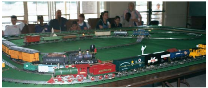
Plenty of action on the layout

Running on the giant layout in the back room there were several pieces of equipment representative of the early days of