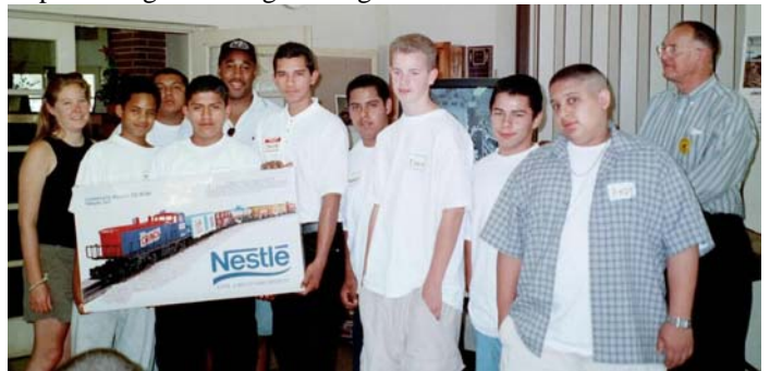
The kids & staff

There was a 4-car passenger train in 'G' gauge. And standard gauge McCoy freight consist. In 'O' gauge some Lionel pre-war tinsplate freight was highballing it.