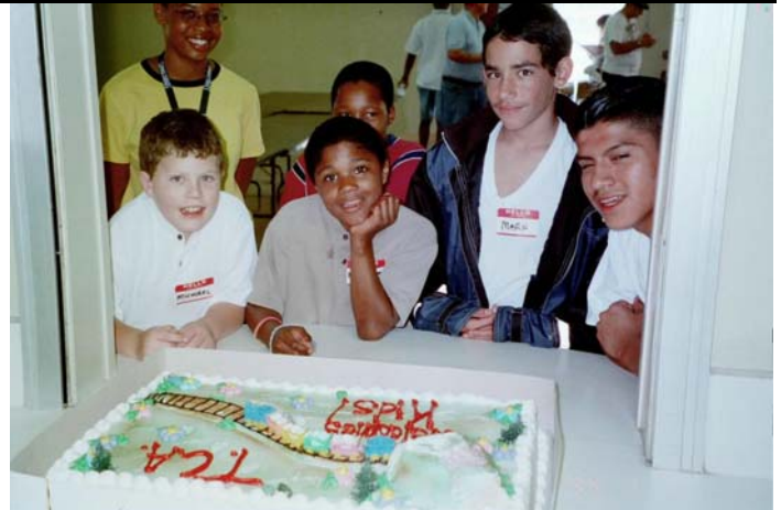
The kids waited patiently for their piece of cake.

In addition, several offspring of TCA Western Division members were on hand to participate in the festivities and receive gifts. Some of the train sets given away were provided through direct donations from Lionel, K-Line and Bachman. Western Division purchased several sets. A cash contribution was made to the club by the Elfun Foundation, as well as by some members, which made possible the acquisition of three of the sets that were presented to the children's groups.