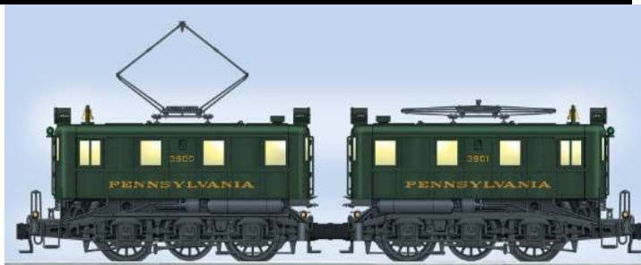
The 'first time ever made' Lionel BB1 Electric Locomotive in 'O' gauge is being offered in the Western Division 2005 Membership Raffle