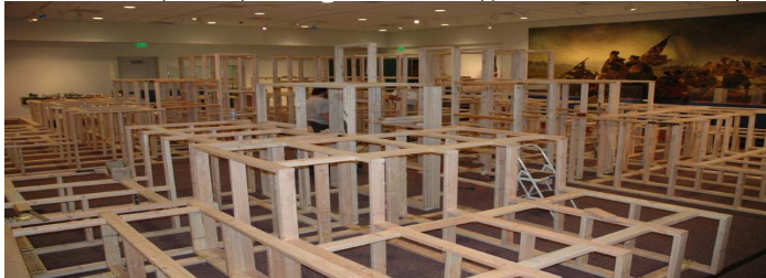
A bird's eye view of the framework before the detail work began.

The layout is 40' by 32', is over 12' high, and takes up most of a 4,000 sq ft room. The display is not conventional. Instead of a flat layout, this one was designed with tiers. Multiple gauges of trains in 'G', 'Standard', 'O', 'S', 'on30' and 'HO' were utilized to provide perspective. The larger gauges run on the lower tiers. The gauges get smaller as you go up the layout. There are 2 main lines of each gauge on each deck. Multiple landscapes have been created and 10 trains run at the same time through the desert terrain, wintry snow covered villages and local townships.