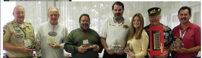
October Raffle winners