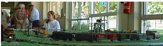
A Marx freight train rounds the curve on the main line as a Lionel Rectifier waits on the siding