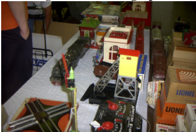
Chuck Stone drove 7 hours with a car load of trains to sell including a Lionel #442 Diner that was like new in the box, and a set of Lionel #205 LCL containers also like new in the box.