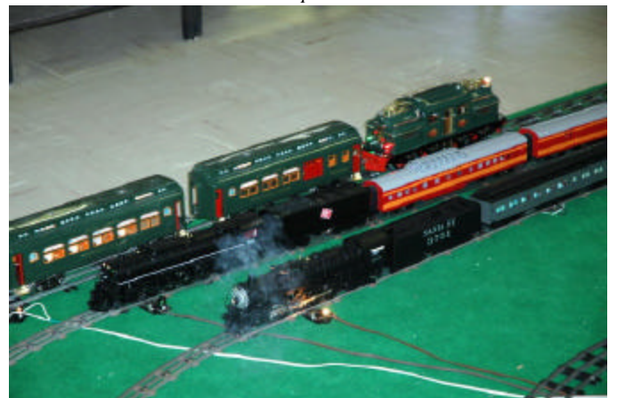
'O' Gauge races past Standard gauge in the make believe Railroad Empire of the back room