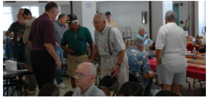
The hustle and bustle at the August meet – at some points it looked like Union Station during rush hour.