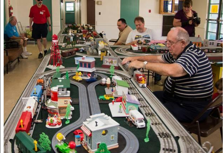
Modular Layout at July Meet

think might enjoy a little 'kid train time.' We have a few things planned for the kids – including pizza for everyone! Now those are words to live by. Hope to see you there.