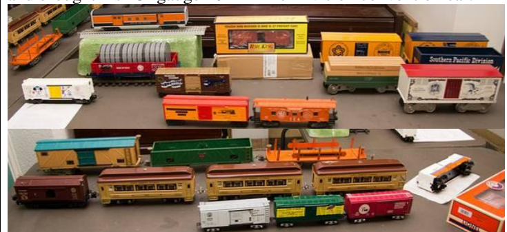
July Display Theme 'Convention Cars'