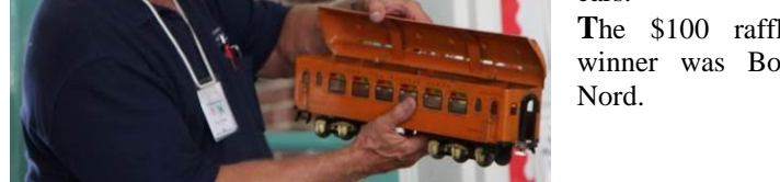
The $100 raffle winner was Bob Nord.