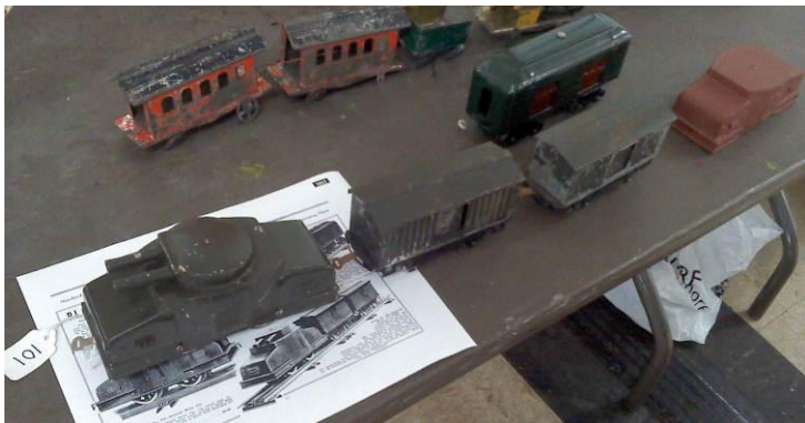
Larry Pearson displayed a 1917 Lionel Armored Motor car engine and cars.