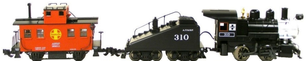
Aristo-Craft 'G' gauge PGN #GXT21309C ATSF 0-4-0 #310 Switcher With Bobber Caboose