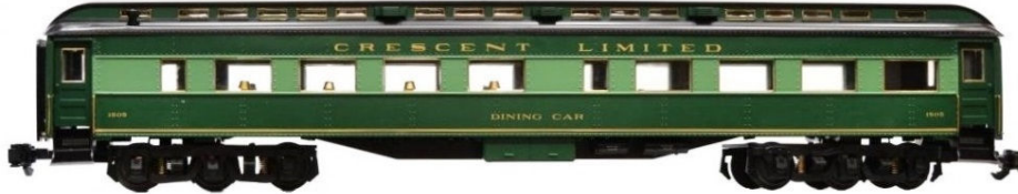
Aristo-Craft G gauge #31505 Southern Crescent Heavyweight Dining Car