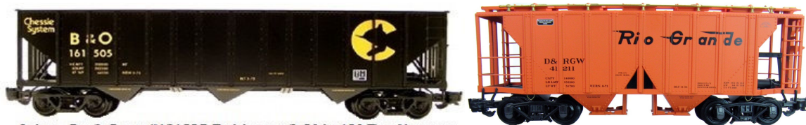
Aristo-Craft G ga. #161505 Baltimore & Ohio 100 Ton Hopper Aristo-Craft G Rio Grande 2-Bay Covered Hopper

Aristo-Craft offered a multitude of G gauge freight cars. These included a 20' Gondola, 20' Tank Car, 20' Flat Car, 20' Box Car, 40' Drop-end Gondola, 40' Covered Gondola, Covered Hopper, Single Dome Tank Car, 100 Ton Coal Hopper, Triple Dome Tank Car, 2-Bay Coal Hopper, Long Caboose, Bobber Caboose, 40' Double Door Boxcar, 40' Plug Door Boxcar, 40' Steel Box Car, Stock Car, Reefer Car, Stake Flat Car, Searchlight Car, Bulkhead Flat Car, Piggyback Flat Car, Wood Truss Reefer, Wedge Snow Plow, RoadRailer, a Track Cleaning Car, and 53' Evans Double Door Box Car. Aristo-Craft large scale indoor/outdoor trains were featured at the Christmas display of the New York Botanical Gardens and at the National Christmas Tree in Washington, D.C. in December, 1994. One of Aristo-Craft's crowning achievements was producing a reliable strong live-steam 2-8-2 Mikado locomotive in G gauge around 2006 that had many great features and was affordable for the masses. This loco had a piezo switch self-starting flame, a 45 minute runtime, built in remote control, insulated wheels to run on electrified track as well, a water watch glass and a pressure valve all included in a metal, wheeled carrying case. In 2009 Aristo-Craft released its second G gauge live steam offering in the form of an 0-4-0 switcher with a slope-back tender.