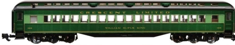
Aristo-Craft G ga. #31305 Southern Crescent Heavyweight Passenger Car

were more toy like, complete with brass railings and other decorations. Since that time there was a steady move toward more and more realism with subsequent releases in live steam radio controlled engines. 1:29 is predominantly American mainline although some locomotives and rolling stock are also made for the European market.