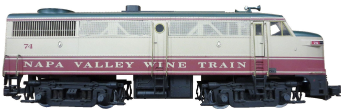
Aristo-Craft G gauge ART-22032 Napa Valley Alco FA-1

Aristo-Craft's remote control system was called the Train Engineer. This was a device that was intended to be electrically inserted between the power pack and the track. The power pack was set to full throttle and left alone and the TE controlled the power delivered to the track providing the advantage of walk around wireless control. The receiver was called an ART-5471 and the transmitter was the ART-5473. The ART-5490 on board receiver was also developed and was intended to be installed inside a loco and powered from an onboard battery or constant track power. Aristo-Craft sold their R/C products under the Crest brand. These products were also available for trains in other gauges.