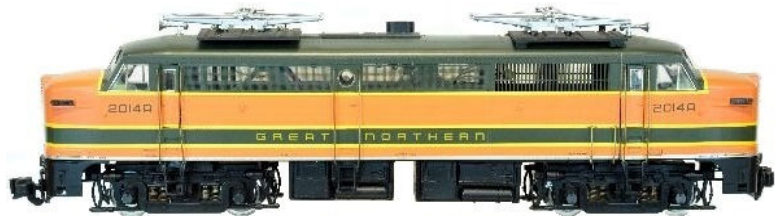
Aristo-Craft 'G' gauge Great Northern #2014A EP-5 Electric Locomotive

Aristo-Craft's primary focus was on making G45 scale/gauge trains easier to use without increasing the technology threshold for the average user. They also believed in mass production of quality products at fair prices. Aristo-Craft introduced radio control and battery operation for its G45 trains. This allowed reduction in reliance on fixed connections through the train tracks to power packs. This greatly facilitated the operation of trains in an outdoor garden setting. Aristo-Craft introduced a trailing stock car equipped with the R/C and antenna system pre-installed so that hobbyists could run any and all of their locomotives without the need for modification or installation of separate R/C units in each power unit. This system was completely plug-and-play, so there was no need for tools or to open up the locomotive to add the R/C capability since all Aristo-Craft locomotives were equipped with battery M.U. plugs. On-board battery power and R/C control meant that there was no need for metal wheels or clean track with better conductivity. Aristo-Craft battery packs