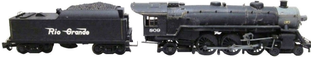
Aristo-Craft G gauge #21409 Rio Grande 4-6-2 Pacific Loco & Tender