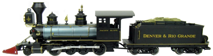
Aristo-Craft 'G' gauge C16 Denver & Rio Grande Pacific Slope 2-8-0 Steam Loco & Tender

including a Jeweled Russian Egg, Lady Bug and the Presidential 1 Oval Office Egg. The Eggliner looked like two end units from an observation car locked together. In 1993 Aristo-Craft acquired Delton Locomotive Works, makers of G scale trains. The acquisition was made primarily to acquire Delton's popular C-16 Classic locomotive representing the 19th Century era. Aristo-Craft updated the loco with die-cast wheels to replace the plastic wheels with metal covers that were hard to produce as round wheels. They also added their patented Prime Mover gear boxes, so that every axle was powered, and fitted the engine with their patented smoke system and a well-style port for DCC or QSI sound. The locomotive was offered as either a wood or coal burner with a matching classic style wood caboose of the same era and a host of former Delton freight cars in the same scale and classic style were also available.