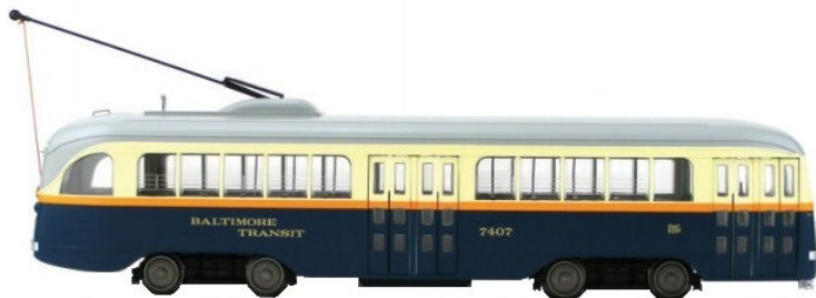
Aristo-Craft G gauge B&O PCC Trolley ART23309

Aristo-Craft issued many G gauge models of famous American diesel locomotives including NW-2 switchers, EMD SD-45's, EMD E-8's, EMD GP-40's, ALCO RS-3's, GE U-25B's, ALCO FA-1's & FB's, Budd Rail Diesel Cars (RDC's), and GE Dash 9-44CW's. Steam Locomotive models included a 2-8-0 Consolidation, a Rogers 2-4-2, an 0-4-0 Switcher, a Pacific 4-6-2, a 2-8-2 Mikado, and the 2-8-8-2 Mallet. They also made a Doodlebug Gas Electric, a PCC Trolley and an EP5 Electric. They entered the European market with a Pan European locomotive called the 'Class 66'. It had features similar to the U.S. style locos. Its prototype was made by EMD in Canada, but not sold or used in the U.S. The Aristo-Craft model was only marketed and sold in Europe. In 2003 Aristo-Craft became the US Distributor of Kiss, a Swiss firm that made G gauge equipment. The Kiss line consisted of brass locomotives and detailed scale-length narrow-gauge Swiss freight cars in plastic with metal wheels. It was these cars that Aristo-Craft began stocking.