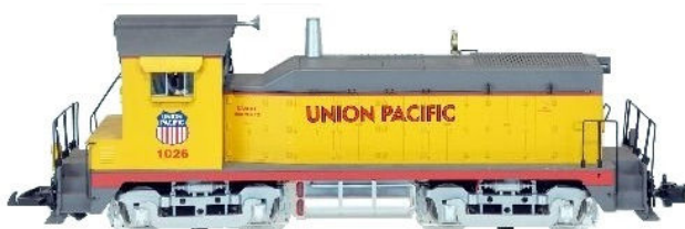
Aristo-Craft Union Pacific #1026 NW-2 Diesel Switcher