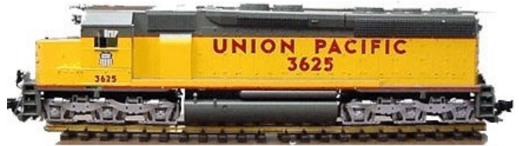
Aristo-Craft Union Pacific SD45 Diesel #3625