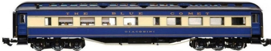
Aristo-Craft G gauge The Blue Comet #31504 Giacobini Heavyweight Diner

Aristo-Craft had designed and started selling a G gauge track line which they merged into their partnership with REA. The track had the highest percentage of copper in the market and featured a patented screw-together rail joiner capability. The REA trade name was used during the partnership. When it was dissolved in 1990 the line was continued under the Aristo-Craft name.