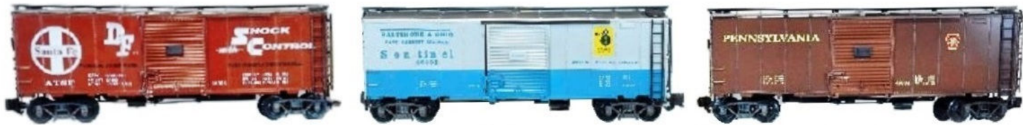
Aristo-Craft REA G ga. 40' Steel Box Cars Includes #46003 Santa Fe Shock Control, #46008 B&O Sentinel, #46009 Pennsylvania

Aristo-Craft issued many G gauge models of famous American diesel locomotives including NW-2 switchers, EMD SD-45's, EMD E-8's, EMD GP-40's, ALCO RS-3's, GE U-25B's, ALCO FA-1's & FB's, Budd Rail Diesel Cars (RDC's), and GE Dash 9-44CW's. Steam Locomotive models included a 2-8-0 Consolidation, a Rogers 2-4-2, an 0-4-0 Switcher, a Pacific 4-6-2, a 2-8-2 Mikado, and the 2-8-8-2 Mallet. They also made a Doodlebug Gas Electric, a PCC Trolley and an EP5 Electric. They entered the European market with a Pan European locomotive called the 'Class 66'. It had features similar to the U.S. style locos. Its prototype was made by EMD in Canada, but not sold or used in the U.S. The Aristo-Craft model was only marketed and sold in Europe. In 2003 Aristo-Craft became the US Distributor of Kiss, a Swiss firm that made G gauge equipment. The Kiss line consisted of brass locomotives and detailed scale-length narrow-gauge Swiss freight cars in plastic with metal wheels. It was these cars that Aristo-Craft began stocking.