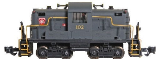
Aristo-Craft 'G' gauge Pennsylvania Switcher #22601C

Aristo-Craft eventually produced a 900 MHz Train Engineer with all the functional capability of DCC for easier use by the outdoor train enthusiast. This was called an ISM - DSS system. It was license free and could be used anywhere in the world. The signal would automatically hop to an open frequency in a millisecond un-noticeable to the user if there was interference encountered. Clean track was a necessity for DCC as the signal traveled through the tracks. The range was roughly 1000 feet. Polk's had previously offered similar radios with a range of up to a mile for use with R/C airplanes. These systems also featured EMF feedback and two way communication with the loco for obtaining actual speed information and other remote data.