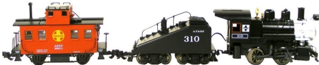
Aristo-Craft 'G' gauge PGN #GXT21309C ATSF 0-4-0 #310 Switcher With Bobber Caboose