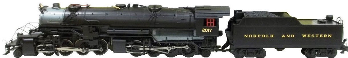
Aristo-Craft G gauge #21607 Norfolk & Western 2-8-8-2 Mallet Steam Locomotive & Tender

flywheels for better locomotive performance, operating front headlight with direction controlled tender light, operating marker/classification lights, moveable cab side windows, black metal drive wheels with electrical pick-up, blackened solid brass grab railings, boiler and cab details including bell, whistle, headlight, and domes, MU plugs for battery hookup, modular PC board with plug & play capabilities, sound, battery, DCC & RCC ready, front AAR knuckle coupler, rear drawbar for long, Vanderbilt or USRA Tenders, extra weight for extra pulling power, and prototypical painting and lettering. This loco could navigate eight foot diameter curves.