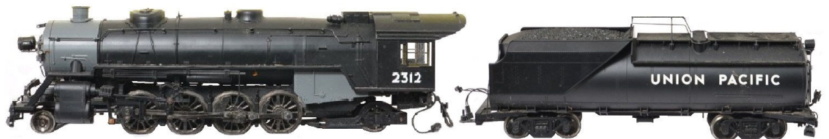
Aristo-Craft 'G' scale #21503 Union Pacific 2-8-2 Mikado Steam locomotive and 8 Wheel Oil Tender #2312

Aristo-Craft Trains, initially called Aristo-Craft Distinctive Miniatures, was founded in