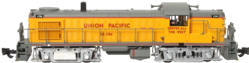
Aristo-Craft 'G' gauge #22202 Union Pacific Alco RS-3 Diesel Locomotive