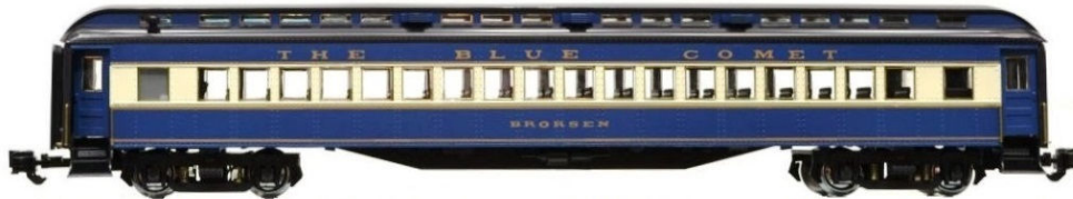
Aristo-Craft G gauge The Blue Comet #31504 Brorsen Heavyweight Coach