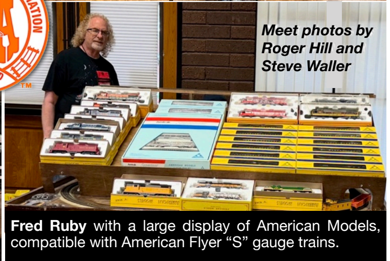
Meet