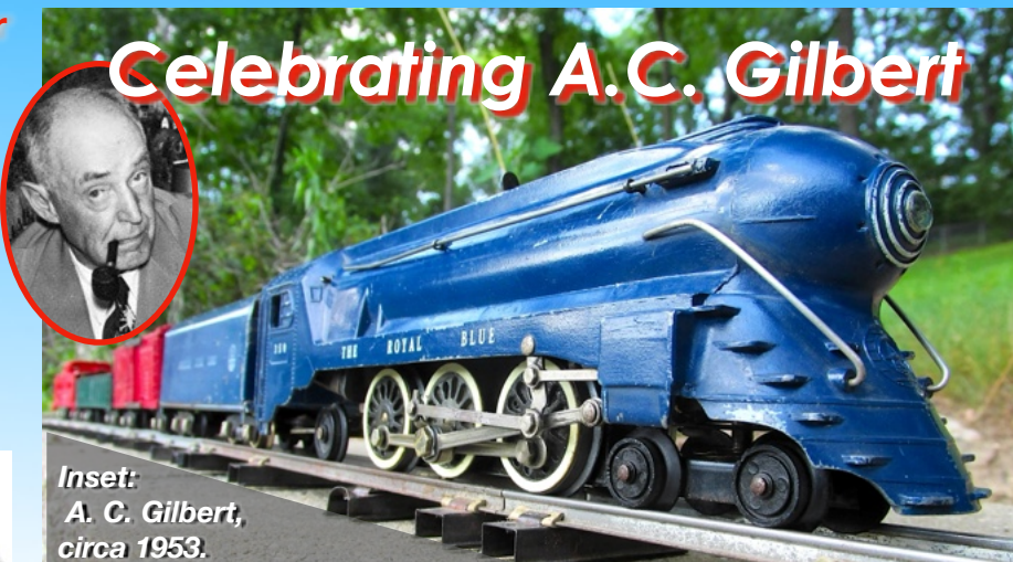
Inset: A. C. Gilbert, circa 1953.

American Flyer postwar 'S' gauge No. 350 model of a B&O Royal Blue 4-6-2 "Pacific" steamer.