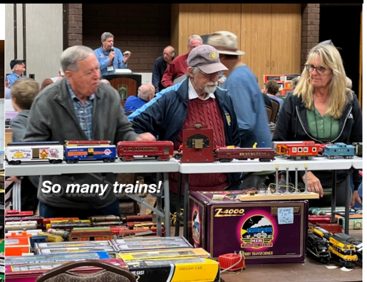
So many trains!