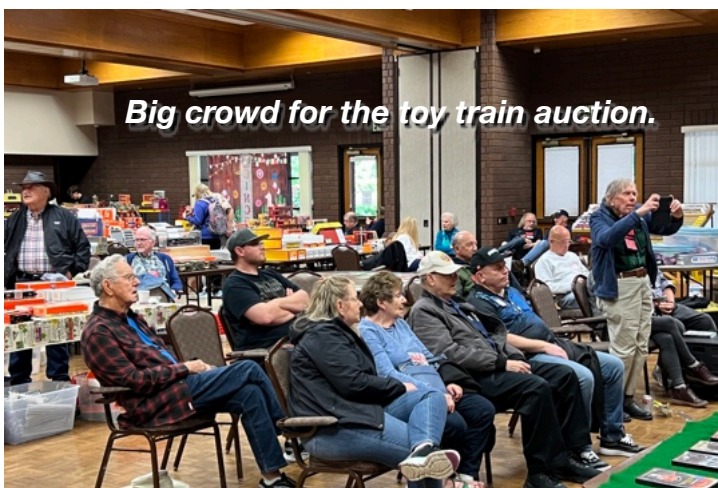
Big crowd for the toy train auction.