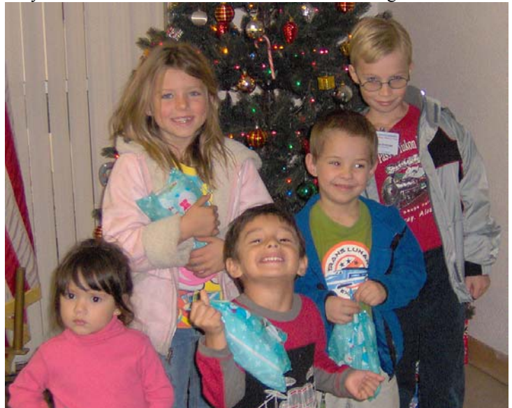
There were drawings for the children in addition to a gift for each.