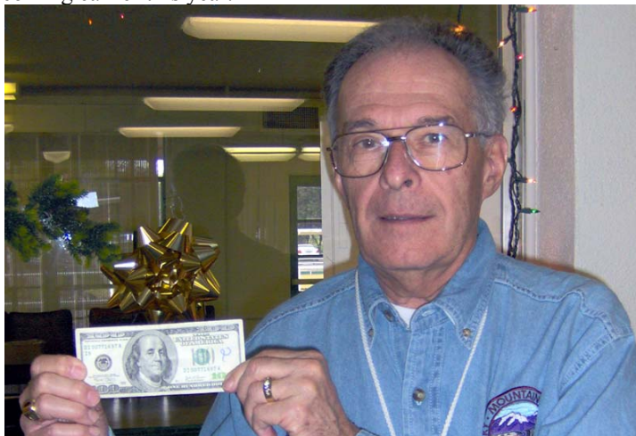
Guess Who Was the Winner of the December $100 Bill? Me!

Western Division scheduled meet dates for 2007 will be: January 27, February 24, March 24, April 28, June 2, July 28, August 25, September 22, October 27, & December 15. There will be no May meet and there will be no November meet due to Cal-Stewart coming earlier this year.