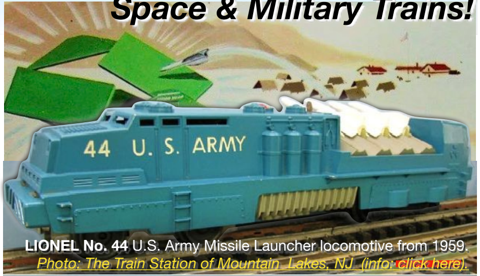
LIONEL No. 44 U.S. Army Missile Launcher locomotive from 1959.

C OMMEMORATE ARMED FORCES DAY with TCA Western! Our next train meet will take place on Saturday, May 23, 2026 at the beautiful, spacious Arcadia Community Center. The theme is Space and Military Trains ( click here ) for Armed Forces Day. Western Division will be hosting a special guest speaker to honor the armed services. (See page 4 for details.)