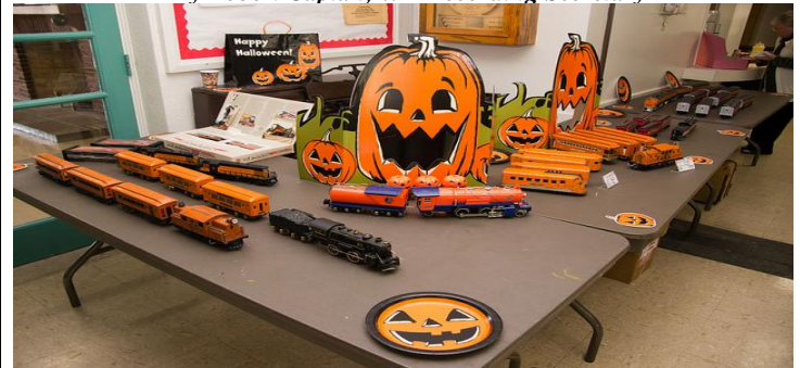
A magnificent display of orange and black trains of all sizes

By Robert Caplan, WD Recording Secretary